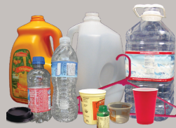
Plastic containers and other rigid plastic items