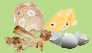
Spoiled food, dairy products, egg shells and meat scraps