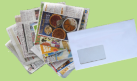
Newspaper, junk mail and magazines