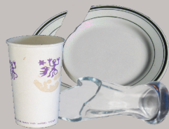
Ceramics and dishware