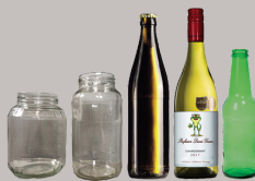
Glass food and beverage containers