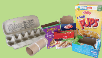
Paper boxes, egg cartons and paper tubes