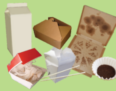
Paper take-out containers and other food-soiled paper