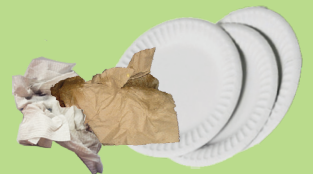
Soiled paper cups, paper plates, tissues and napkins