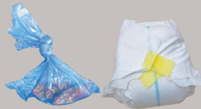
Pet waste, diapers and feminine products