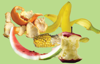
Fruit and vegetable scraps