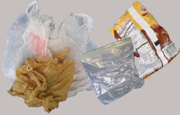
Plastic bags, film and wrap