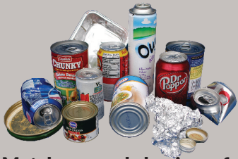
Metal cans and aluminum foil